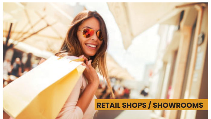
RETAIL SHOPS / SHOWROOMS

CITY COURT is standing proudly as the perfect landmark gaining from adjoining residential area; over 5,00,000 families are estimated in the vicinity. The periphery is seeing a spurt of commercial and retail space is making Zirakpur the most active, fastest growing and well developed region for the coming future.